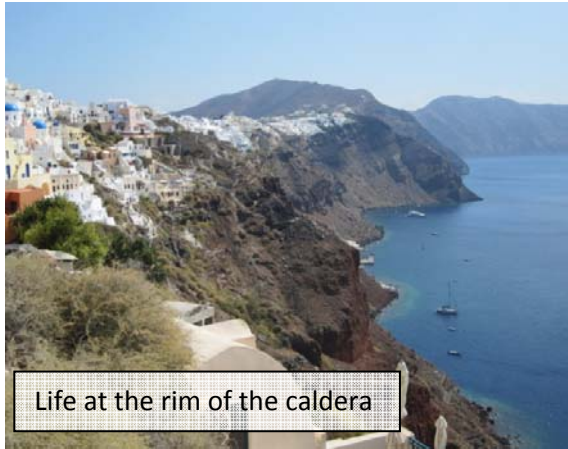
Life at the rim of the caldera

even to the untrained eye. 10 This geo-tectonic event essentially wiped out organized civilization in the Eastern Mediterranean and the Aegean. This eruption, to some accounts, gives body to the legend of the lost continent of Atlantis. 11 The civilizations and communities that were ruled by the god hallucinations of their selves or god kings were disrupted and individuals were forced to fend for themselves. This displacement of the comforting god consciousness and forced individual innovation is then the start of the transition to modern consciousness. The Thera eruption nucleated the beginning of the breakdown of god consciousness through the displacement of peoples and the subsequent wars as they moved onto the territory of more settled and less innovative people who were, in turn forced to on-the-spot innovation in resisting the pressure of invaders.