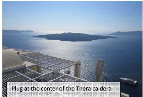
Plug at the center of the Thera caldera

There were other bicameral civilizations. The ancient Hebrew writings document the same transition in that culture a little later as we saw from the Amos and Ecclesiastes samples above. We also see a more recent breakdown in the clash of civilizations between the bicameral Central and South American Indians as they met with the unquenchable gold lust of the Spanish conquistadores. In my own readings of North American Indians, I find that the mystics or sensitive oracle prone individuals who were also prone to hallucinations were regarded as holy men; their council was honored within their community. Native American literature is filled with vision quests by individuals that were taken seriously when they returned from their isolation and fasting in the wilderness.