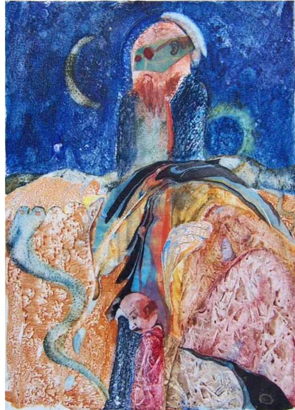
"Search for Meaning," mixed media watercolor/collage by Cecy Rose.

But let someone (somehow) go on TV and proclaim, "I am nothing; I have done nothing; I will always do nothing. I have no claim to any form of spiritual knowledge.... But you may want to stick around to hear what I have to say about the beauty of all this nothing stuff...." What do you think will happen?