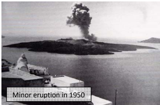
Minor eruption in 1950

even to the untrained eye. 10 This geo-tectonic event essentially wiped out organized civilization in the Eastern Mediterranean and the Aegean. This eruption, to some accounts, gives body to the legend of the lost continent of Atlantis. 11 The civilizations and communities that were ruled by the god hallucinations of their selves or god kings were disrupted and individuals were forced to fend for themselves. This displacement of the comforting god consciousness and forced individual innovation is then the start of the transition to modern consciousness. The Thera eruption nucleated the beginning of the breakdown of god consciousness through the displacement of peoples and the subsequent wars as they moved onto the territory of more settled and less innovative people who were, in turn forced to on-the-spot innovation in resisting the pressure of invaders.